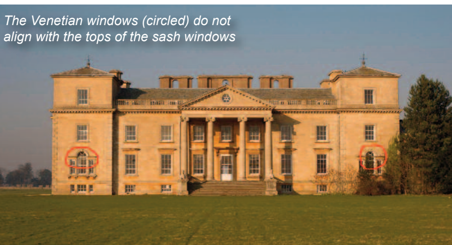
The Venetian windows (circled) do not align with the tops of the sash windows

up in her report, "There is something undeniably alluring about its picturesque charm, its imperfections and anomalies which make it seem both accessible and mysterious. These qualities seize the imagination, excite curiosity and inspire a remarkable sense of loyalty and commitment".