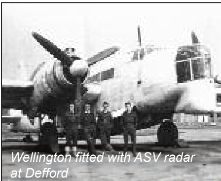
Wellington fitted with ASV radar at Defford