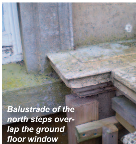
Balustrade of the north steps overlap the ground floor window

It starts before you even get inside. For example: