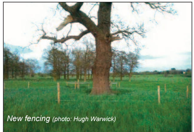
New fencing

was a problem. Since then Park Warden Hugh Warwick, working in co-operation with our tenant farmers, has been busy fencing around the base of these trees to protect them from direct damage by stock. This action should ensure that they have the best chance of prolonging their natural lives for as long as possible. Hopefully, they will continue to be features of the landscape and homes for rare beetles at least until the long term replacements planted by the Trust have matured to take their place.