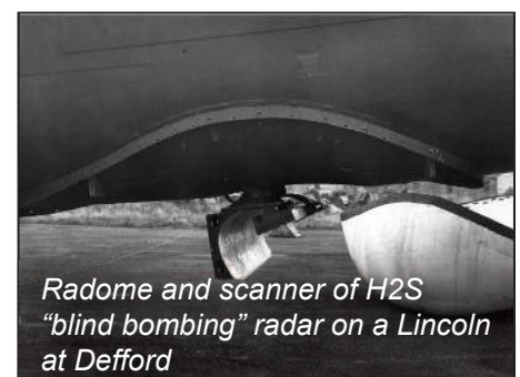
Radome and scanner of H2S "blind bombing" radar on a Lincoln at Defford