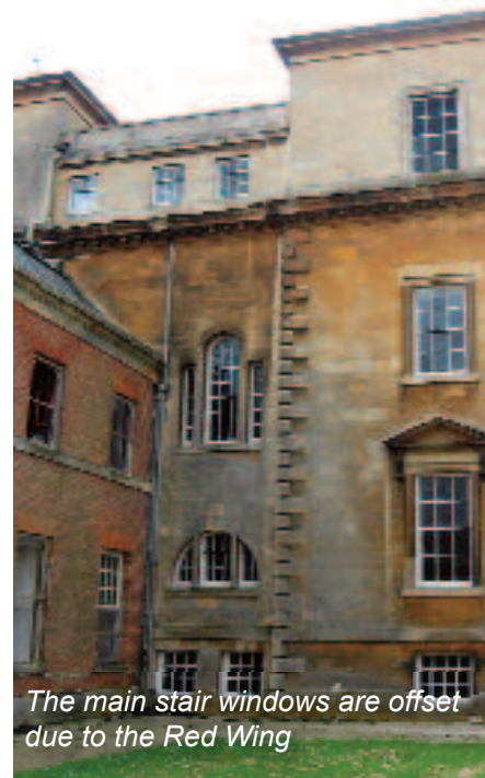
The main stair windows are offset due to the Red Wing

up in her report, "There is something undeniably alluring about its picturesque charm, its imperfections and anomalies which make it seem both accessible and mysterious. These qualities seize the imagination, excite curiosity and inspire a remarkable sense of loyalty and commitment".