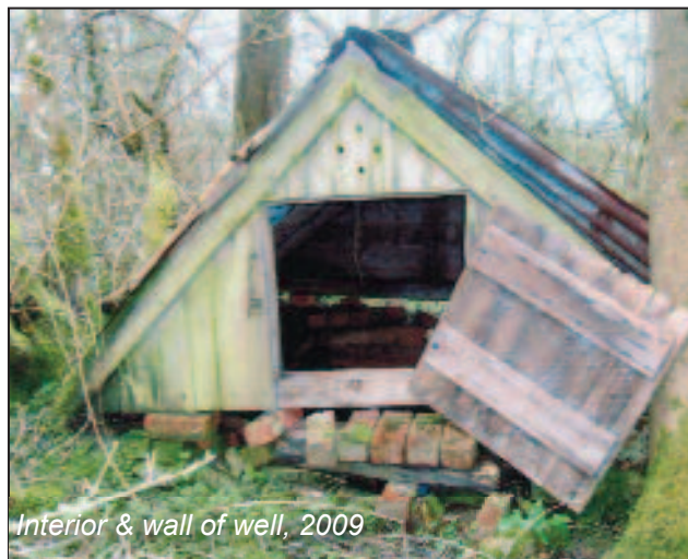
Interior & wall of well, 2009

Lord Coventry had two Grand National winners, Emblem and Emblematic, 1863 and 1864, and these horses used the pool along with Captain Coventry's racehorses, who were trained at Croome Court in the yard behind the main stable block and indoor riding school. There were over 20 stables with green doors and they were demolished in the late 1960s. It has always been a great benefit to racehorses to soak their legs in salt water to harden them and, when my father trained racehorses, I used to be sent down to the Baths with a ten gallon milk churn to collect salt water for their legs.