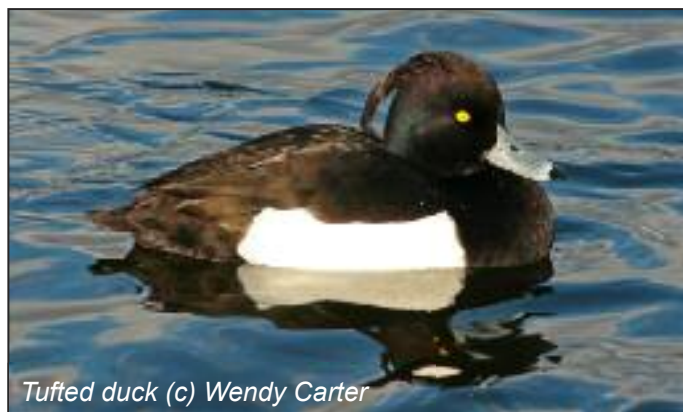
Tufted duck

Simon informed us that, over the last seven or eight years there have even been rare sightings of a Great Grey Shrike and an Osprey (on migration north) through the Park ..... so the future is looking rosy for the birds at Croome.