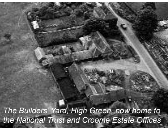
The Builders' Yard, High Green, now home to the National Trust and Croome Estate Offices