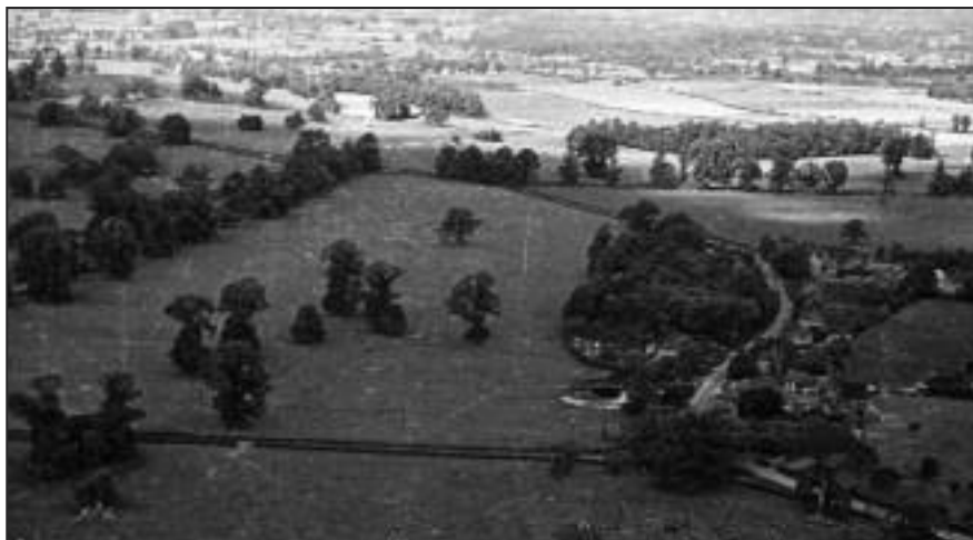
The M5 now dissects the sunlight fields beyond the village of High Green