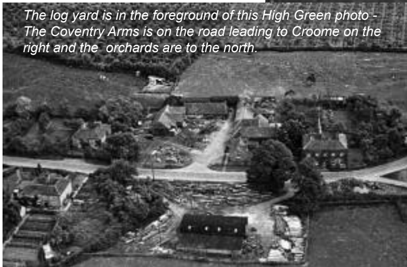
The log yard is in the foreground of this High Green photo - The Coventry Arms is on the road leading to Croome on the right and the orchards are to the north.