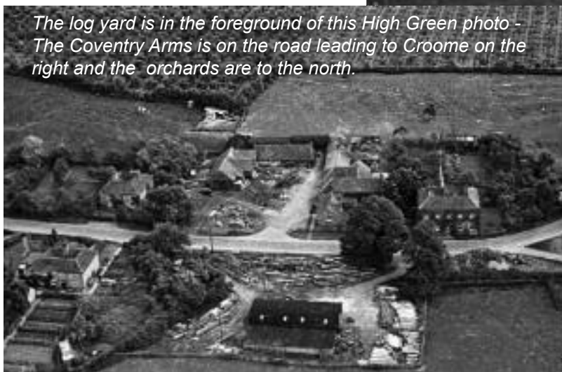
The log yard is in the foreground of this High Green photo - The Coventry Arms is on the road leading to Croome on the right and the orchards are to the north.