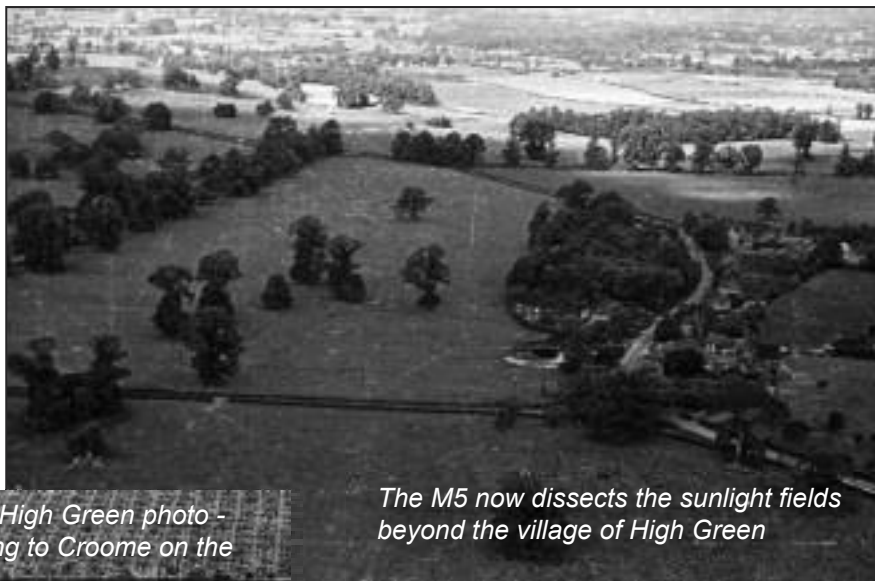
The M5 now dissects the sunlight fields beyond the village of High Green