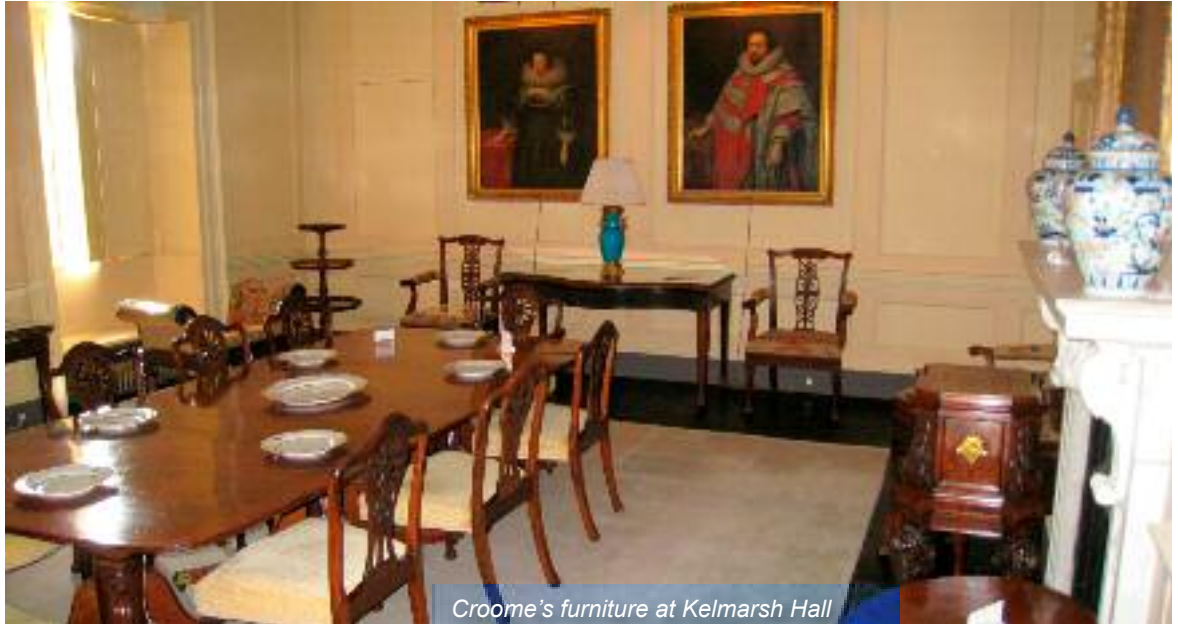
Croome's furniture at Kelmarsh Hall