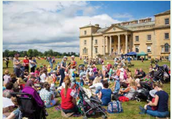
Summer Reading Challenge at Croome, July 2016

Working with Lemn Sissay MBE, Cathy Cassidy, Jeremy Strong, Steve Cole, Tom Palmer, Jonathan Emmett and many others has helped raise the profile of Croome to an audience of readers nationally. As part of the events, bespoke projects have been commissioned such as children's books, poetry slams and competitions. Due to the popularity of the events we have attracted the attention of the National Trust's very own publisher who we are currently in talks with to develop our ideas nationally as part of the National Trust's Children's Book Festival.