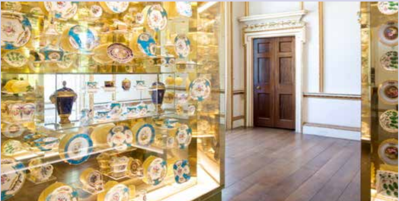
Inside the Golden Box

In 1948 Croome was sold, the 10th Earl had died in France in 1940 and the family trust was no longer able to keep the court viable as a home, and at the same time most of the collection was sold. Some 1,200 objects from the collection remained in the care of the Croome Estate Trust ever since but not kept at Croome. Following a very recent major repair programme to the building and installation of new services, the property will be taking back on loan a substantial collection of furniture, ceramics and paintings. The challenge now is how best to display them.