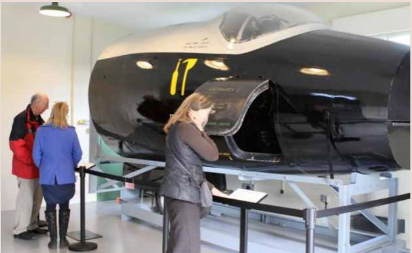
Nose section of Canberra in the restored RAF Defford Ambulance Garage

DAHG were also instrumental in securing funding to restore and preserve the former Ambulance Garage to house the Canberra and other exhibits, and the former Mortuary, which provides the Museum with a