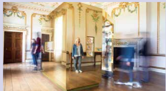
The Golden Box at Croome