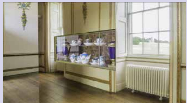
A reflected landscape

'Capability' Brown's landscape beyond it – they all become part of the experience. The Golden Box is a unique experience allowing visitors to immerse themselves in a sea of ceramics, and more and more are coming to Croome to experience it first-hand.