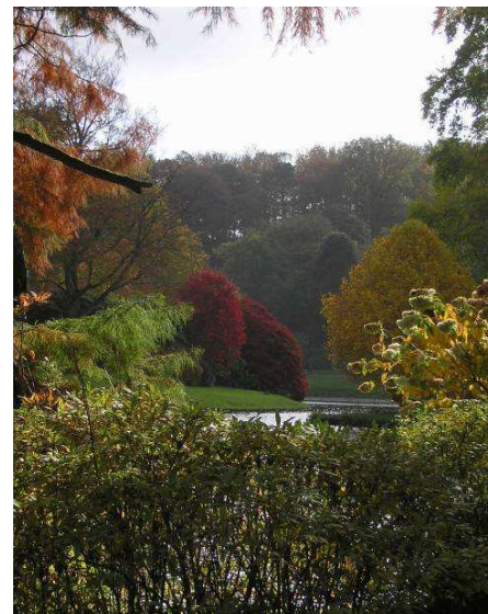
Stourhead in Wiltshire – another beautiful National Trust garden

A. George II Duke of Coventry Duke of Hamilton Duke of Argyll